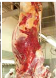
Generalized contusion in the carcass due to poor handling during pre-slaughter.