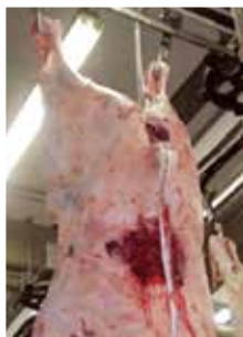
Contusion located on the carcass due to a blow to the animal's back.

Aiming to reduce bruising and, consequently, damages, the use of handling practices that preserve the well-being of the animal is recommended also on the properties, replacing the aforementioned objects by flags and minimizing the use of electric prods, leading to calm and suitable boarding processes. These practices, therefore, consist of ways of engaging in animal welfare.