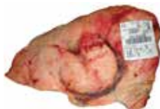
Mark of the rancher on the meat of the animal.