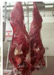
Generalized contusion in the carcass, animal lying inside the truck.